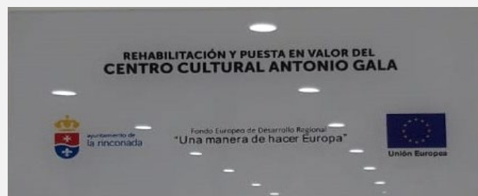
LOCATION OF THE THEATER IN THE MUNICIPALITY OF LA RINCONADA / PLATE REF. EU