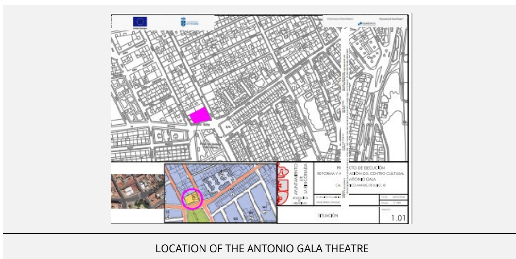
LOCATION OF THE ANTONIO GALA THEATRE

In this sense, the cultural activity of the municipality will be jointly promoted, enabling it to become a driving force for creativity, completing the “great cultural ring” of the town.