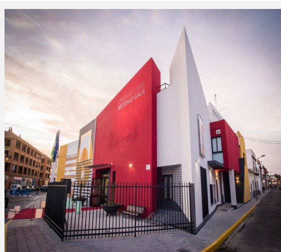
AFTER THE PERFORMANCE

The total investment in this action has been 800.351,55 €, of which 384.000,00 € corresponds to the ERDF co-financing. The impact of the action is reflected, on the one hand, in the adaptation of the "Centro Cultural Antonio Gala" and its adaptation to the