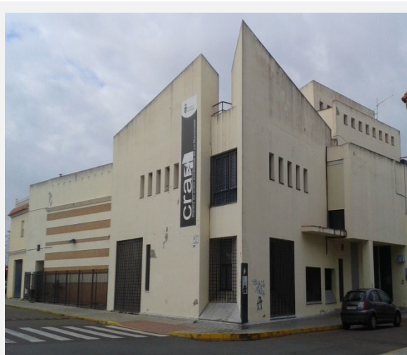
BEFORE THE PERFORMANCE

The Antonio Gala Theatre was opened on 10 February 1995. It was in a state of deterioration, with problems of accessibility for disabled people, safety problems in access due to the narrowness of the urban road, sanitary problems, unsustainable enclosures, leaks in the roofs, etc. Due to these circumstances, it was necessary for the City Council to intervene effectively to improve the conditions offered to both artistic and creative entities and the public, in order to be able to hold cultural and artistic activities. By creating this New Scenic Space with a modern and functional design, the municipality aims to complete its "great cultural ring", facilitating the connection between creators and the public to whom they are addressed, to develop, promote or host activities in different areas of culture, in any of its manifestations.