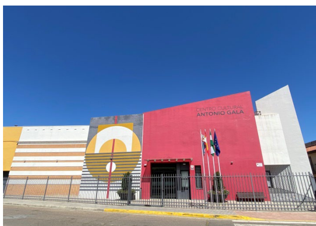
SIDEWALK WIDENING TO IMPROVE ACCESSIBILITY

In addition, in order to contribute to environmental sustainability, energy efficiency measures have been taken into account, replacing the previous ones with colored lacquered aluminum carpentry with thermal bridge break, improving the building's energy savings.