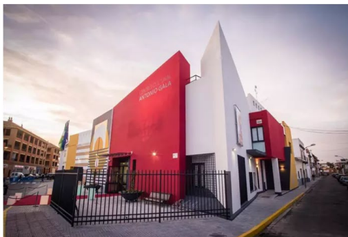
El Centro Cultural Antonio Gala de La Rinconada - AYUNTAMIENTO DE LA RINCONADA