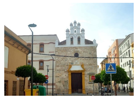
St Anton's Chapel