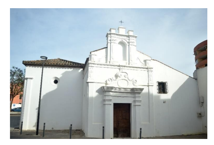
Chapel of Cristo de la Alameda

1.- The role of the ERDF in the action has been appropriately publicised both by means of the mandatory communication and by exceptional acts. Thus, in all three cases the information poster was installed, it was published on the municipal website, and even in the case of the Alameda Chapel a permanent plaque was placed.