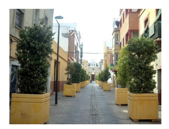
Cayetano del Toro Street

These ashlars have been recovered to preserve the original image of the chapel, as it was conceived in the 18th century.