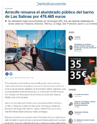
Diario de Lanzarote

Similarly, the digital press has also been vital for the continued dissemination of the action, under the importance of the role of the ERDF in the financing of the project: