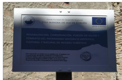
Permanent photo plaque

The corresponding dissemination has been carried out using the following additional media and tools: