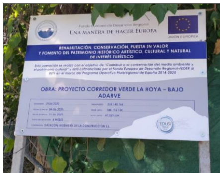
Photo of the construction site poster

Likewise, as a mandatory requirement, the project has been publicized through the construction sign and final plaque installed at the beginning of the corridor, in a location widely visible to all users of the corridor.