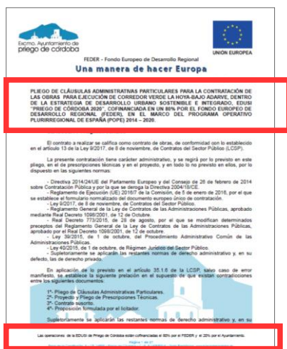
Administrative specifications for works contract

Information and communication have been key elements in the implementation of the Green Corridor, through a wide range of tools and actions. Along these lines, the operation has been adequately disseminated among the beneficiaries, as well as to the general public. In this sense, the information and publicity measures for actions co-financed by ERDF funds have been considered, and all administrative documents, posters and publications have included the logo of the European Union, the reference to ERDF funds, including the percentage of financing, and the slogan "A way of doing Europe".