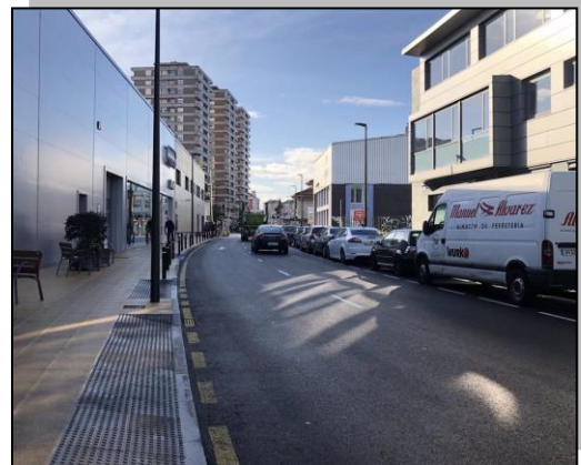
Renovation of the road and construction of Sidewalks in the PASEO DEL NIÑO – Current state