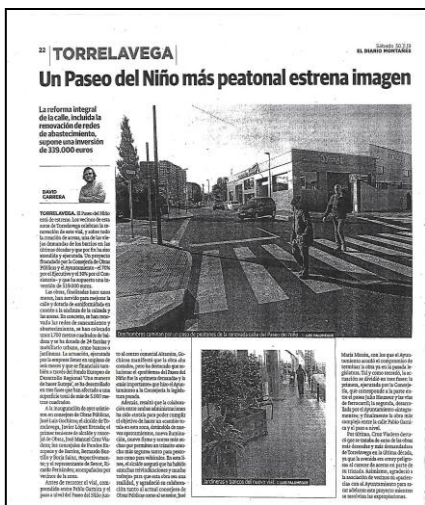
Press release of 30 NOVEMBER 2019