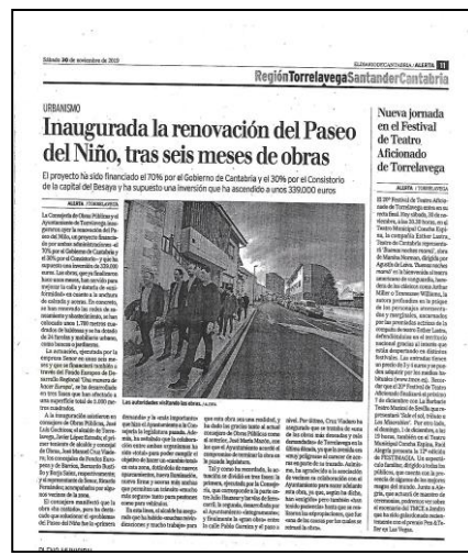
Press release of 30 NOVEMBER 2019