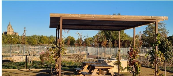
Situation pre and post reforms.