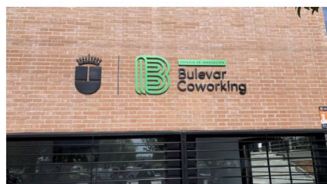
Espacio de Innovación Bulevar Coworking de Alcobendas / Ayuntamiento de Alcobendas

El Espacio de Innovación Bulevar Coworking nace para apoyar proyectos emprendedores y facilitar soluciones de economía sostenible