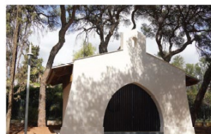
El Consistorio ha ejecutado una completa remodelación de la capilla

Para la revitalización urbana y medioambiental del Vigil de Quiñones, el Ayuntamiento ha destinado más de medio millón de euros cofinanciados al 80 por ciento por el Fondo Europeo de Desarrollo Regional (FEDER) en el marco del Programa Operativo Plurianacional de España 2014-2020, con el que se ha conseguido aunar los conceptos de parque-jardín y espacio urbano. En este punto, la alcaldesa explicó que la puesta en valor de este pulmón verde "forma parte de la línea de trabajo que estamos impulsando en materia de mejora, rehabilitación y recuperación de los espacios urbanos y naturales para ponerlos al servicio de la ciudadanía".