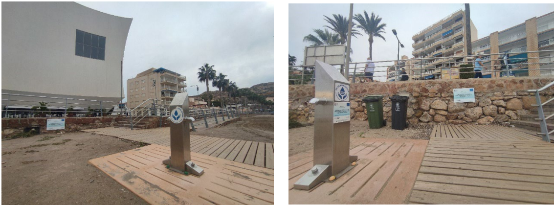
Figure 9. Pictures of the footbaths installed around auditorium area, Infanta Doña Elena Conference Centre Parra Promenade areas.

Finally, it should be noted that the toilet modules are equipped with infrared sensors, to control the ignition of the interior luminaires, so that they are activated only when people enter the cabins. By doing this, saving in energy consumption will be achieved.