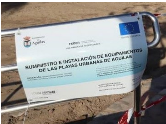
Figure 4. Temporary post