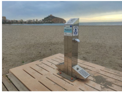
Figure 8. Picture of a footbath near the Civil Guard Station

On the other hand, under the footbaths, systems have been put in place to facilitate the drainage of water in the natural soil. They are draining plates of precast concrete, which will filter the