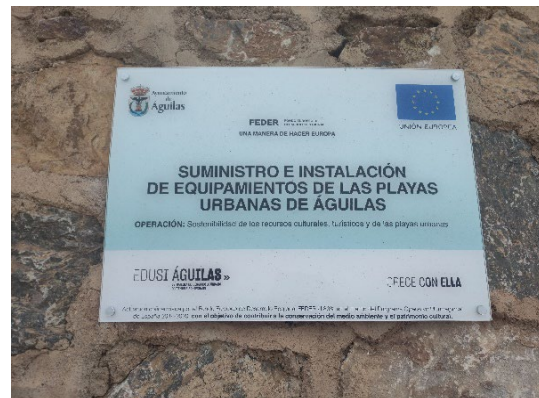
Figura 5. Permanent plaque

Various publications have been made on the EDUSI website, as well as through social networks: