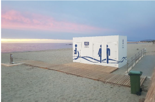
Figure 2. Toilets installed in Poniente Beach