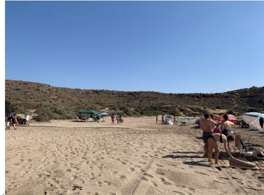
Figure 3. Picture of Playa de la Higuera

All the planned facilities are detachable so they do not affect the Natura 2000 sites of the beaches of La Carolina, La Higuera and Calarreona, located within the protected area of Cuatro Calas (with LIC condition (SiteCode: ES6200010) and the ENP of Cuatro Calas (SiteCode: ENP000007).