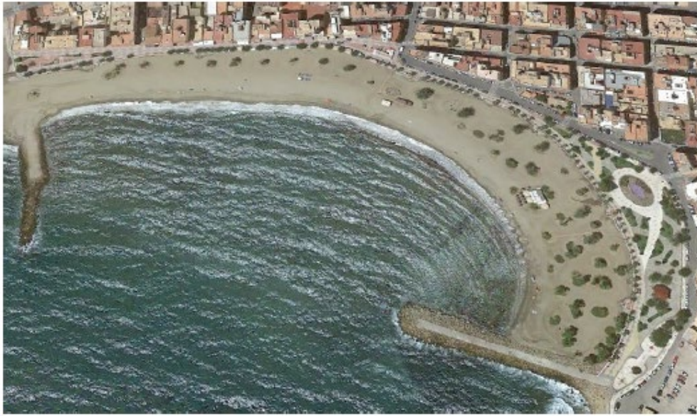
Figure 1. Aerial photography of Playa de la Colonia

A good practice consists of the supply and installation of equipment on the beaches of La Carolina, La Higuera, Calarreona, Casica Verde, Poniente, La Colonia, Levante, Las Delicias, Hornillo and Calabardina; with the aim of providing quality beaches that respect the environment to visitors and residents, while also offering services for their comfort and hygiene. It should be noted that the refurbishment measures have included infrastructure to improve accessibility to beaches for people with reduced mobility.