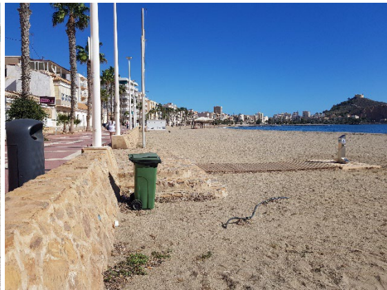
Figure 11. Picture after the intervention