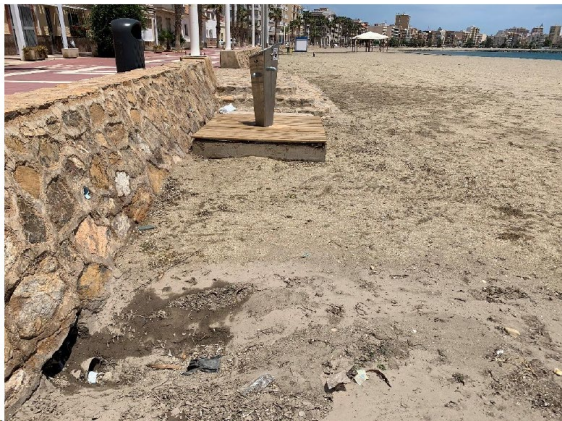
Figure 10. Picture before the intervention

The city, being coastal and housing several urban beaches, presents a unique geographical situation that allows its inhabitants to directly take advantage of these natural resources. The intervention has achieved this by implementing a series of small-scale tourism infrastructures that have transformed beaches for greater enjoyment not only by visitors, but also by local residents.