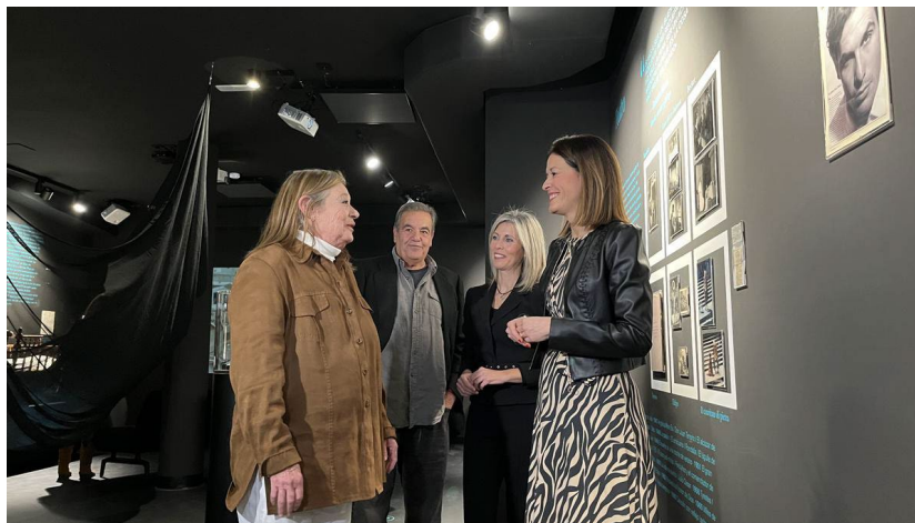
Figure 16. Picture of Paco Rabal Museum

This intervention has a budget of EUR 171.202,90, of which an 80 % were financed by the European Regional Development Fund (ERDF), reaching an amount of EUR 136.962.32.