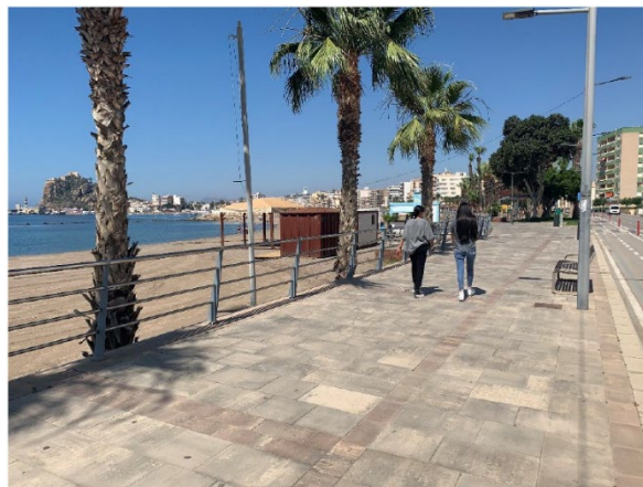
Figure 12. Picture of the urban beach Las Delicias

The installation of walkways has significantly improved the accessibility to the beaches. This ensures that all people, regardless of their mobility, can access and enjoy the beaches. This benefits both the local population (36 403 inhabitants in 2022, which triples in summer), who can enjoy the beaches of their city, as well as visitors who want to experience the natural