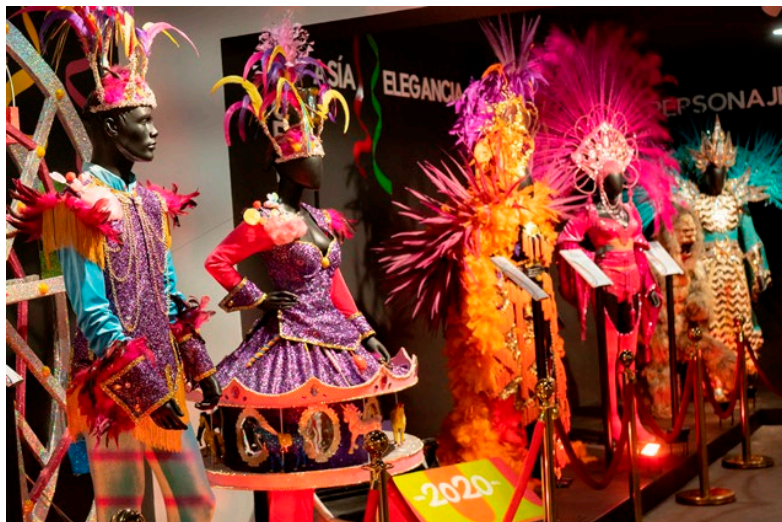
Figure 14. Picture of the Carnival Museum

It also contributes to the sustainability of the cultural and tourist resources of the city, just like the rest of the operations included in EDUSI Sustainable Águilas, to which it belongs. This is why it establishes a special synergy with the creation of the Francisco Rabal Interpretation Center and the Carnival Museum, as well as with the rehabilitation of the La Loma chimney; these interventions have provided new tourist resources to the city, promoting revitalisation and increasing the attractiveness of the urban fabric for residents and visitors.