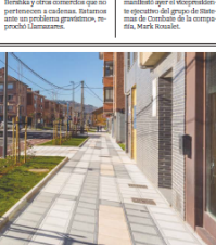
Un LUGONES por y para las personas. Reurbanización integrada de la Avenida de Viella...