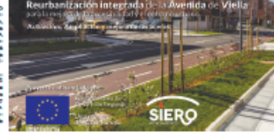
Un LUGONES por y para las personas. Reurbanización integrada de la Avenida de Viella...