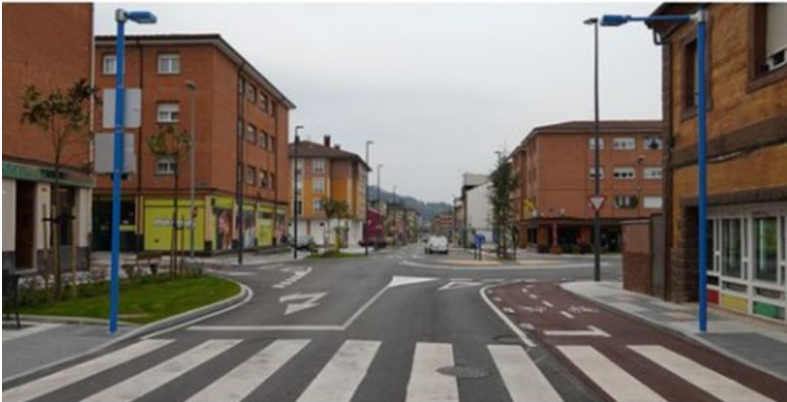
Avda de Viella before and after the performance