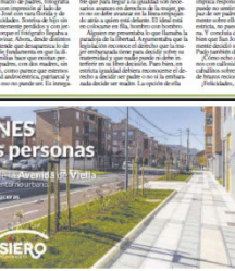
Un LUGONES por y para las personas. Reurbanización integrada de la Avenida de Viella...