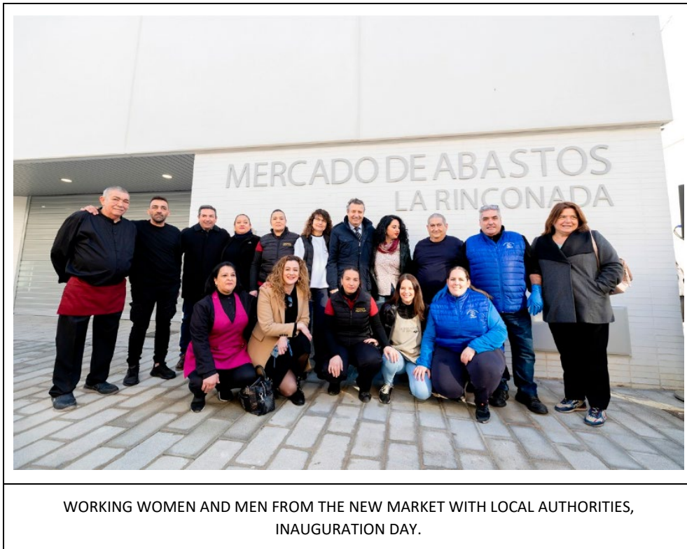
WORKING WOMEN AND MEN FROM THE NEW MARKET WITH LOCAL AUTHORITIES, INAUGURATION DAY.

2.7. Synergies with other policies or public intervention instruments. This takes into account that the intervention has reinforced the action of other policies and has contributed to reinforcing positive aspects of the same.