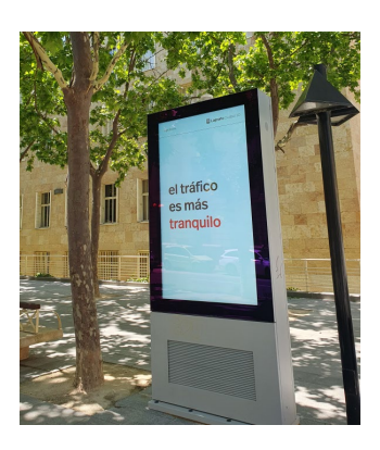
{\it Image of a to tem installed in the area near Logro\~no Town Hall}.

As an additional element and in order to further strengthen the communication and dissemination of the operations and their BPs, a network of digital billboards will be used, consisting of totems installed in different points of the city, which will improve the visibility and inform about all the actions developed within the EDUSI.