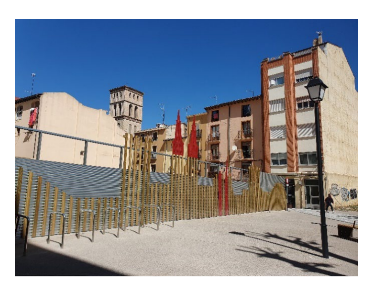
Image of the current state of the space between Los Yerros and Hospital Viejo streets.

The Best Practice consists of the pedestrianisation of Calle Hospital Viejo and Calle Los Yerros, in the La Villanueva neighbourhood, which forms part of the historic quarter of the city of Logroño. This action involves the transformation of these two streets, as well as the square between them.