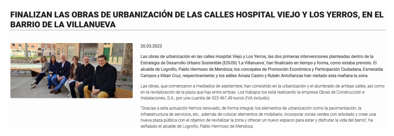
Image of the press release of 20 March 2023 published on the municipal website.

→ 20 March 2023: "Logroño - Finalizan las obras de urbanización de las calles Hospital Viejo y Los Yerros, en el barrio de La Villanueva (logrono.es)"