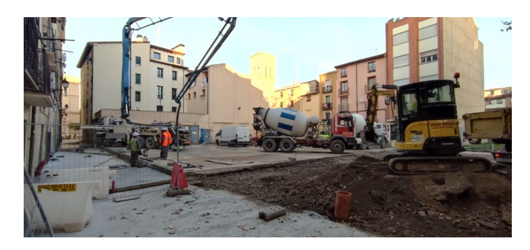
{\it Image of the development of the construction work.}

In terms of social responsibility and environmental sustainability, the actions carried out for the development of this BP are fully in line with the principles of sustainable development at an environmental, social and economic level, sustained at regional and national level, in accordance with the legislation in force.