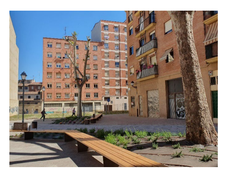
Image of the current state of the Rosario Lamela Square generated in the space between Yerros and Hospital Viejo streets

Another remarkable element is the fact that the EDUSI and its actions for La Villanueva were designed in line with the Europe 2020 Strategy for smart, sustainable and inclusive growth, and incorporates the economic, environmental and social dimensions contemplated therein. In addition, the 2030 Agenda and the Logroño Urban Agenda are important strategic documents that have also been taken as a reference by the EDUSI for the design of its actions.