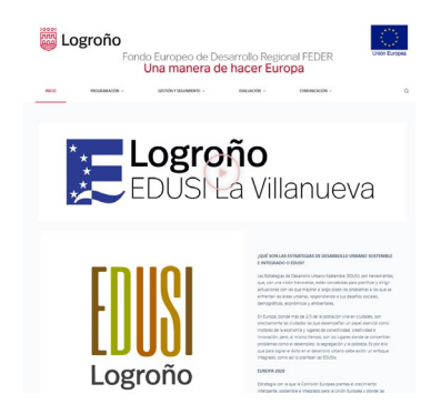
Imagen del espacio web de la EDUSI de Logroño: http://edusi.logrono.es/

This space includes all the communication elements used in the publicity campaign. As part of this campaign, the BP action for Operation 1 has been disseminated among the public through a range of media. For this purpose, different resources have been used: Video with English subtitles, to be disseminated through the EDUSI website and in all public spaces of the City Council where possible, news in local, written and digital press, and regional radio spots.