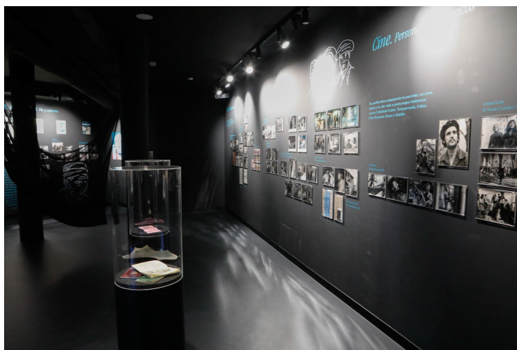
View of part of the exhibition in the Francisco Rabal Interpretation Centre.

As for social responsibility, with this type of action the local cultural heritage is valued and new spaces are proposed for Águilas residents and visitors to meet, which undoubtedly helps to achieve greater social cohesion. Strengthening the pride of the population is a cohesive and uplifting factor for the community.