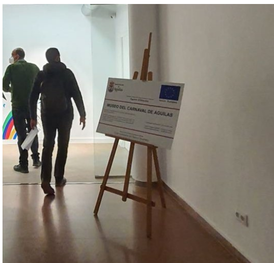
Temporary panel of the Carnival Museum

During the execution of the work, temporary panels were placed at the entrance of the Cultural Centre, presenting the start date, name, context, and budget of the action, as well as the municipal and ERDF co-financing. Later, at the end of the works, permanent plates were installed to show the name, context and objective of the action.