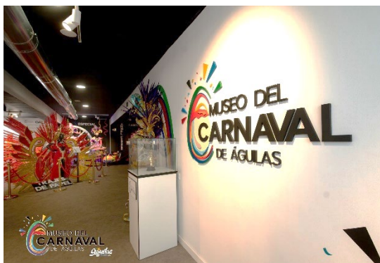
Carnival Museum

Furthermore, the museum space celebrates also the figure of Francisco Rabal, one of the great Spanish actors, born in Águilas. This intervention renews and adapts a space located in the same building as the Carnival Museum, to house contemporary museum exhibits capable of recounting the actor's story in a didactic and experiential way. This space is designed to satisfy the interest of all kind of audiences in the life of Paco Rabal. This space complies with the existing regulations of universal accessibility and will be a reference at the national level due to the relevance of the artist's elements that it exhibits.