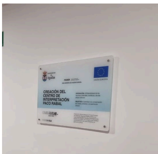
Permanent plate in the Paco Rabal Interpretation Centre

Regarding complementary communication , traditional ( press ) and digital media have followed the advancement of the action, explaining that it belongs to the “Águilas SOSustainable” Sustainable and Integrated Urban Development Strategy, and highlighting the 80 % co-financing by the European Regional Development Fund.