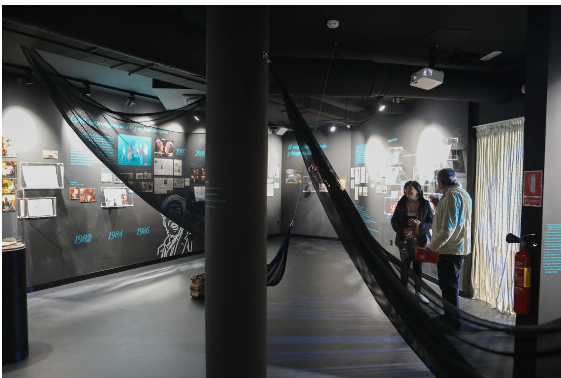
Central installation.

In addition, the centre of the room is endowed with a special atmosphere, since various videos and other audiovisual materials will be projected on fabrics and boat ropes, recalling the sea, the environment in which the actor was raised.