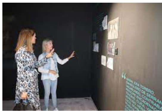
Paco Rabal Interpretation Centre

This action has entailed a total cost of €238,606.42, which has been co-financed up to 80 % by the European Regional Development Fund (ERDF) , which has contributed a total of €190,885.14 .