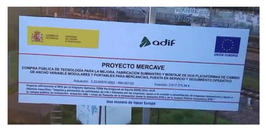
Sign at the gauge changer site

An informative sign displaying FEDER co-financing has been installed in Cordoba, specifically at the location of the gauge changer.