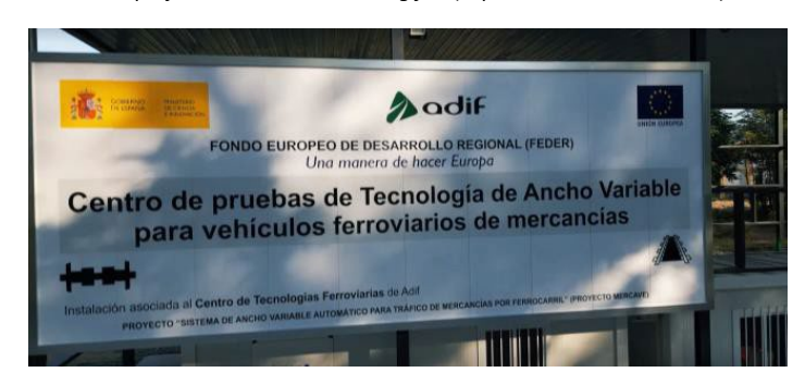
- MERCAVE project sign at the final event (June 16, 2023)

During the project, videos were produced and disseminated through digital media, emphasizing the funding line and FEDER support, with extensive outreach to the general