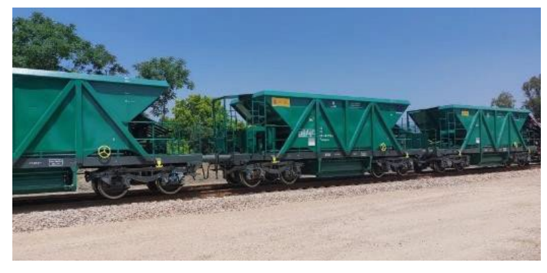
Hopper wagon acquired for the installation of Variable Gauge Axle (EAVM)

Supplies acquired within the framework of the MERCAVE project have been suitably labeled in accordance with advertising standards.