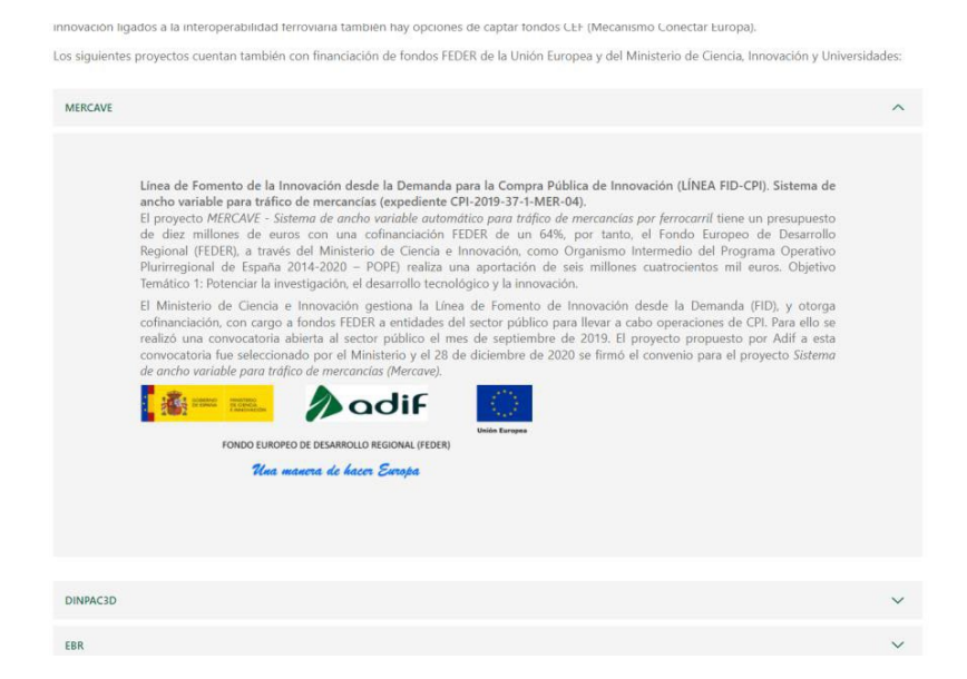
Specific page on European R&D&I funding

An informative sign displaying FEDER co-financing has been installed in Cordoba, specifically at the location of the gauge changer.