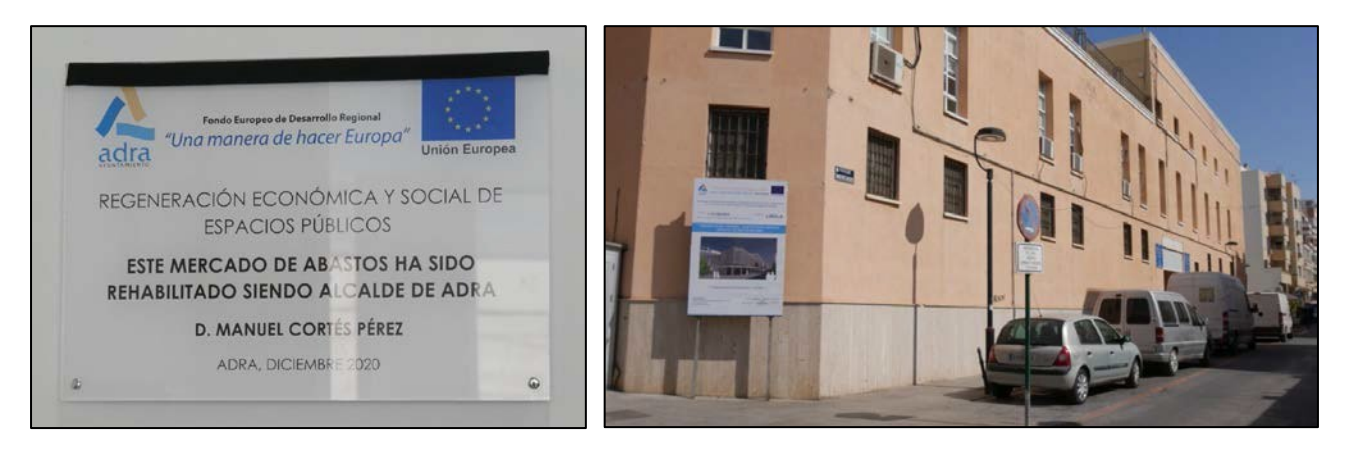
(Photograph of the construction poster and permanent plaque located in the Adra Market)

In addition, a specific web space has been created on the Adra City Council page for the dissemination of the actions co-financed by the FEDER, through which this action has been reported. The news on the web can be consulted at edusi.adra.es. As an example: <u>https://edusi.adra.es/index.php/noticias/168-el-mercado-de-adra-reabre-tras-las-obras-de-transformacion-y-adaptacion</u>