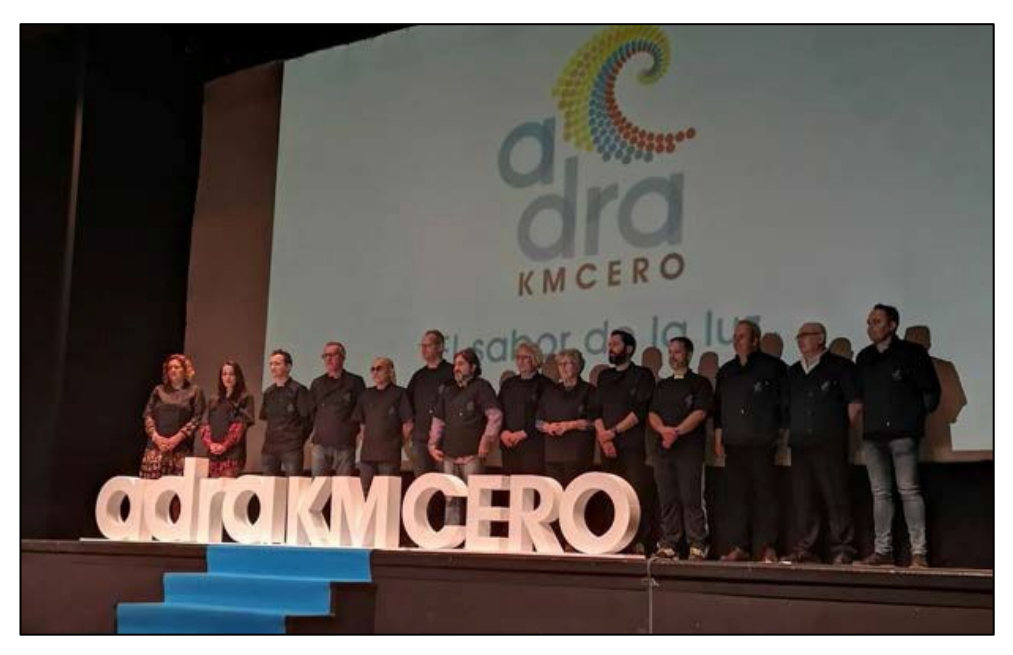
(Photograph presentation event 'Adra KMCERO')

Broadly speaking, this plan covers the recovery of Abderitan gastronomy based on authenticity, local and seasonal products, promoting the consumption of local foods, encouraging direct purchases from small producers located within a radius of no more than 100 km (which allows reducing the chain of distributors and helping the local sustainable economy).