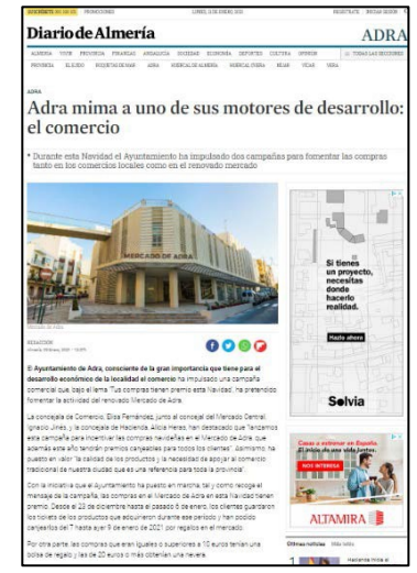
(Examples of publications in digital press)