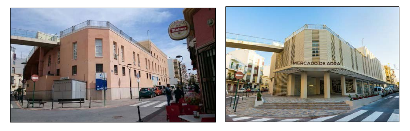
(Mercado photo before the performane)

The Adra City Council presents the Rehabilitation, Reform and Adaptation of the Adra Market as a good practice. This project contemplates the complete renovation of the image of the Central Market, from the exterior to the interior, in order to give it a modern and warm appearance. This action aims to make this location so important for the city's commerce, an open, illuminated, modern and functional space inside, where, in addition to the existing stalls, gastrobars and other premises with varied uses could be installed. that will form a commercial core with its own entity and character. The reform and remodeling of the Central Market is one of the most ambitious projects included in the EDUSI Adra Ciudad 2020. It is framed within Thematic Objective 9, Economic and Social Regeneration and will be 80 percent financed by the European Union, through from the FEDER and 20 percent from the Adra City Council.