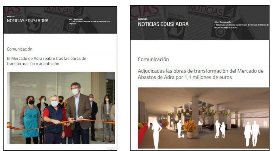
(Examples of web publications)

In addition, a specific web space has been created on the Adra City Council page for the dissemination of the actions co-financed by the FEDER, through which this action has been reported. The news on the web can be consulted at edusi.adra.es. As an example: <u>https://edusi.adra.es/index.php/noticias/168-el-mercado-de-adra-reabre-tras-las-obras-de-transformacion-y-adaptacion</u>