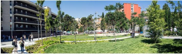
Inaugurada en 2017, la plaça de les Dones és un homenatge a la lluita feminista del districte.

L'Estratègia de Desenvolupament Urbà Sostenible Integrat (EDUSI) incorporarà la urbanització ja finalitzada de la Plaça de les Dones, al barri de Les Roquetes, en el marc de l'Operació "Disseny i implementació de mesures d'urbanització que redueixin el trànsit de vehicles privats i millorin la dedicació de l'espai públic a la mobilitat sostenible i la millora de la qualitat de vida", i per tant rebrà el cofinançament del 50% mitjançant el Fons Europeu de Desenvolupament Regional (FEDER).