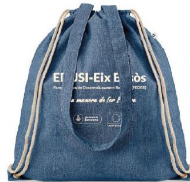
Elementos de merchandising editados

The development of Plaça de les Dones is part of the collection of Good Practice Journals, published by Barcelona City Council, on initiatives considered good practices in the framework of the EDUSI Eix Besòs project.