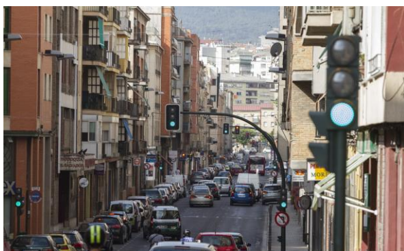
Previous state of Entenza Street

The action presented as good practice is the redevelopment of Na Saurina d'Entença, one of the most important streets in Alcoy, nearly a kilometre long, which was in very bad condition due to the heavy traffic pressure it has been subjected to for decades, as it is the entrance road from Valencia and a crossing of the old N-340 as it passes through the city. The reurbanisation involves the renovation of the paving, the installation of new urban furniture, the elimination of obstacles and the widening of pavements to give more prominence to pedestrians and with the aim of boosting commerce in the area.