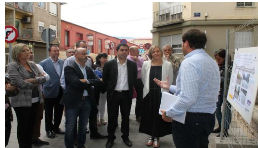
Meeting with neighbourhood organisations and groups Visit of the Regional Minister for Public Works