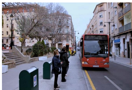
Current state of Entenza Street

The eligible cost of this operation is €1,692,841, of which 50% (€846,442) is co-financed by the European Union. As an indicator of the impact of this action, it can be highlighted that the pavement used manages to neutralise around 50% of the nitrogen oxide and volatile organic compounds emitted by traffic during the year.