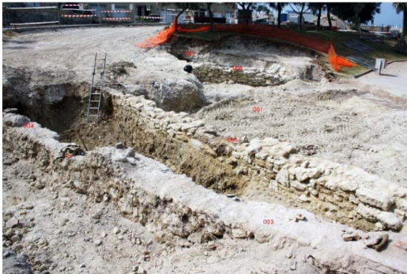
Remains of the “Fuerte de Santiago”