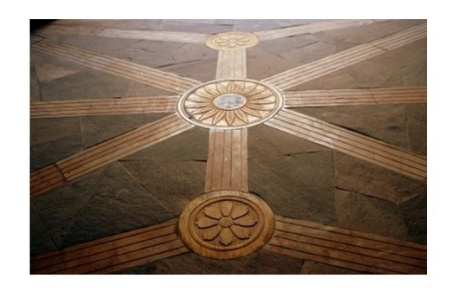
Details of the floor of the Chapel