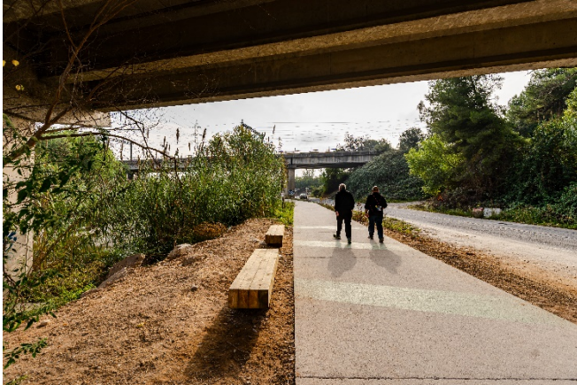
Clota Street below AP7 Road, Cerdanyola del Vallès