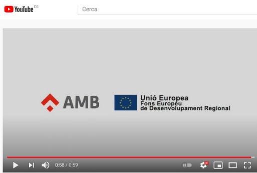
Cami del riu de Molins de Rei