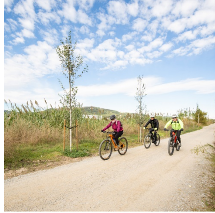
Llobregat river path, Molins de Rei