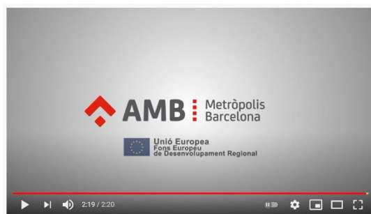
Programa FEDER AMB 2014-2020