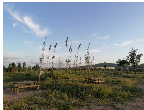
Picnic Area Pahissa river, Sant Joan Despi

The main objective of this project is the conservation and protection of the environment, as well as to promote the efficiency of natural resources by protecting and restoring biodiversity and soil and promoting the aforementioned ecosystem services, although it also seeks to recover and preserve the ecological and landscape quality of the area and to open new public spaces to the population.