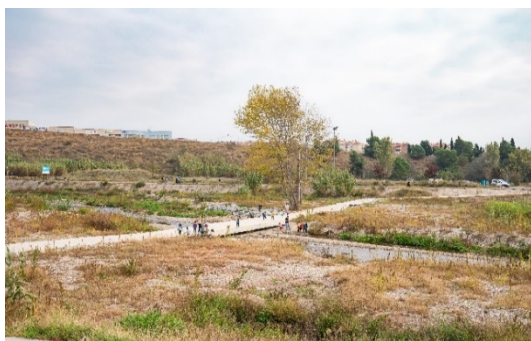
Ripoll River, Ripollet (Besòs)

Also noteworthy is the improvement of the existing section, the pavement and the margins of the path parallel to the high-speed train tracks in the municipality of Santa Coloma de Cervelló, as well as the incorporation of new signage along the entire path. Finally, it is worth highlighting the actions to improve the natural space in the area of influence of Collserola, located in the middle of the Besòs and Llobregat rivers, where measures are being implemented to improve the environment and pedestrian connectivity.