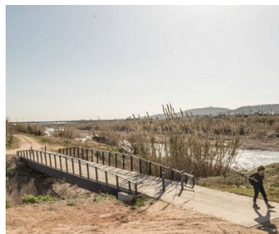
Comerç River walkway, Sant Feliu de Llobregat (Llobregat)