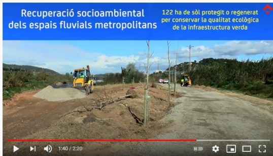
Programa FEDER AMB 2014-2020