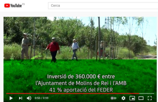
Cami del riu de Molins de Rei