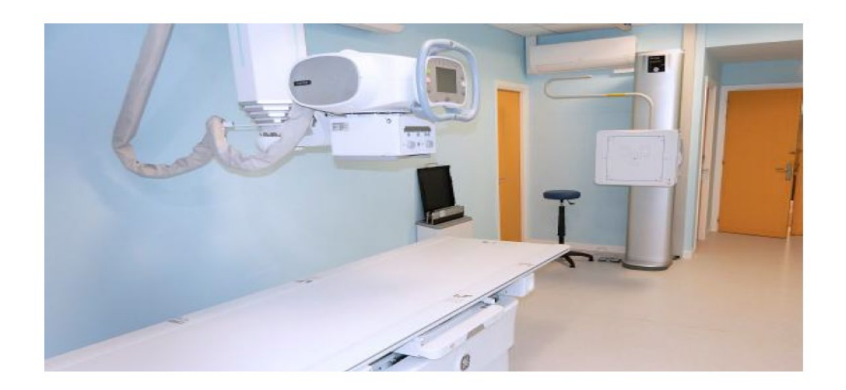
21/01/2021 Consejería de Sanidad

Para reforzar el servicio y adaptar espacios a las nuevas necesidades Galería Multimedia que impone la Covid-19