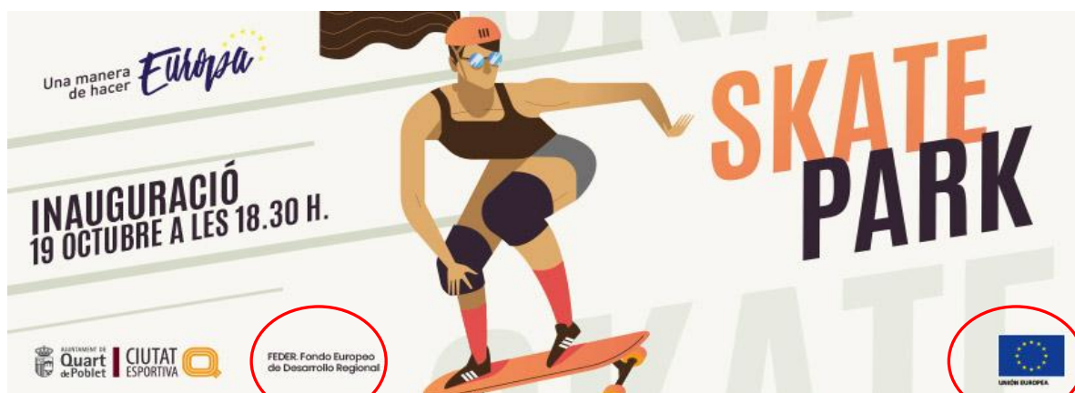
Promotional poster depicting a female skater as its protagonist

Skateboarding is a predominantly male sports practice, though this trend is changing, and it is culturally associated with male youth. With the aim of reversing this reality and encouraging increasing numbers of women into this sport, it was decided that the image on all digital and print banners, leaflets and adverts in the advertising campaign to launch this facility should be a female skater.