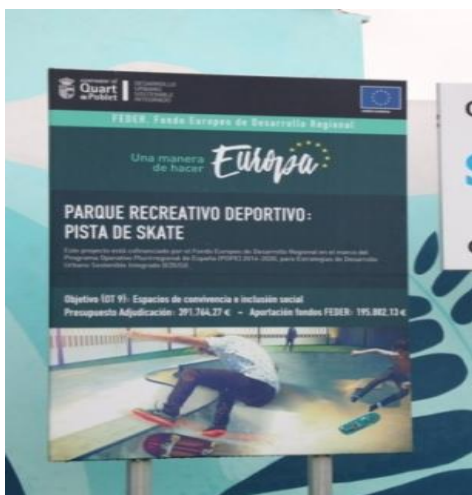
SIGN AT THE WORKS

The regulation sign was erected during works execution along with the corresponding plaque, and the notice published on the specific section of the member state's unique municipal web portal.