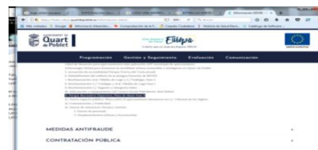
UNIQUE MUNICIPAL WEB PORTAL