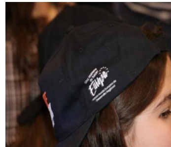
Promotional skate caps

At the Skate Park opening event, a promotional activity was run for all residents. During the opening a stage was erected with an off-stage area. Information leaflets on the project were distributed, describing the ERDF which co-financed the operation.