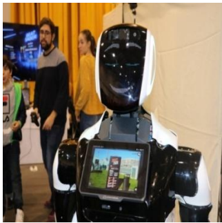
Robot playing the Skate Park promotional video

Insofar as complementary communications go, the activity was publicised prior to opening. The event, branded “Fira de Nadal” (Christmas Fair), was open to the entire population and attended by around 2,000 people, offering activities aimed at the general public. The Skate Park video was installed on the screen of the robot Bibot, one of the event’s main attractions, giving information on the operation and operational programme.