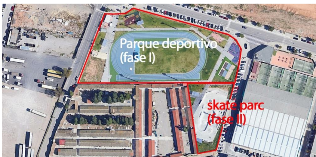
Sports park: an intervention initiated by the Residents' Children's and Youth Sports Council. To the left, the first phase of execution using own and Valencia Provincial Council funds. To the right, facilities funded by the ERDF.

Accordingly, construction of the skate park forms part of the second phase of the global project Sports Centre and Recreational Park, the first phase of which was construction of an athletics track, the children's playground and the bio-health games area. It was subsidised by the Valencia Provincial Council, so that this good practice reinforces the first intervention and boosts its positive aspects.