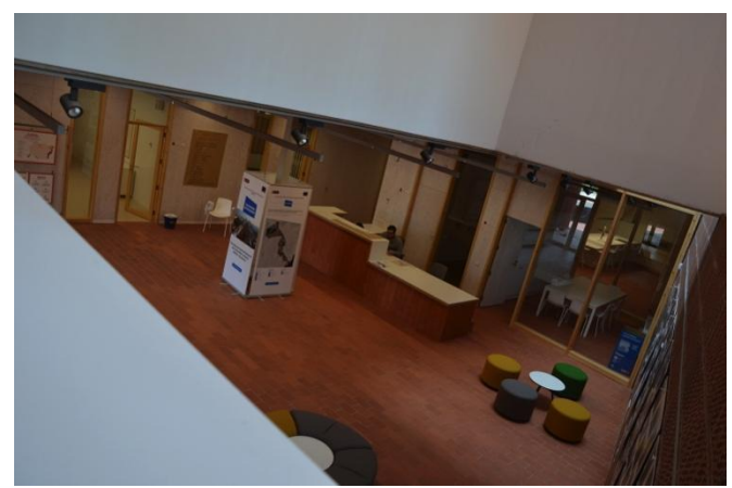
Exhibition "EDUSI Eix Besòs" in the Centre hall