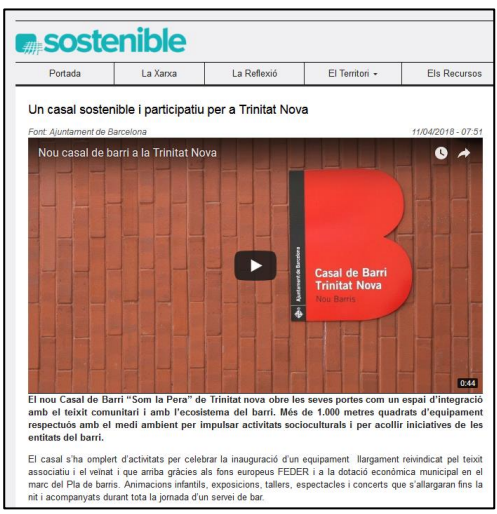
News item about the operation

In relation to the published news, it is worth stressing the note published in the 'OBRA' newsletter of the Barcelona City Hall in November 2018 on the EDUSI project, which includes details of the project.