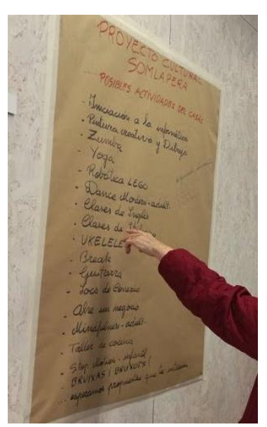
Meeting on the 'Somlapera' cultural project

Another innovative aspect of the operation is that, in order to promote the participation of its citizens and associations, a civic management system by non-profit entities is expected to be put in place, with a strong foothold and knowledge of the territory. This model has been implemented in a number of facilities throughout the city for some time, and experience confirms that it is a very important tool to facilitate participation and involvement. In this sense, the impact on the society as a whole is enhanced, as it is the citizenship that effectively drives the model of community centre that better meets its needs. In the case of Trinitat Nova, the Trinitat Nova 'open table' will run the cultural project 'SomlaPera' of the new community centre through civic management.