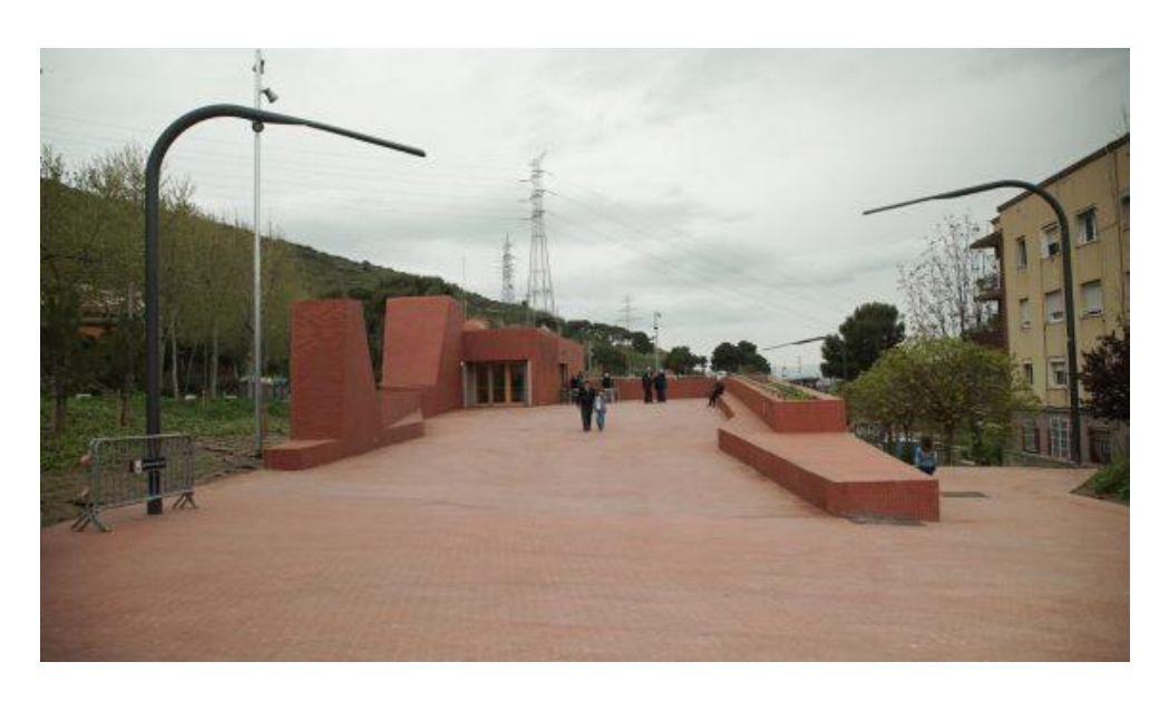
Trinitat Nova Community Centre – external appearance