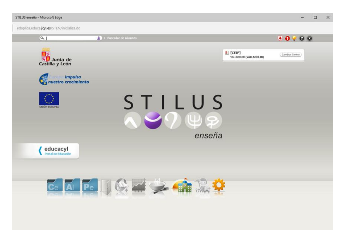
The homepage of STILUS-ENSEÑA