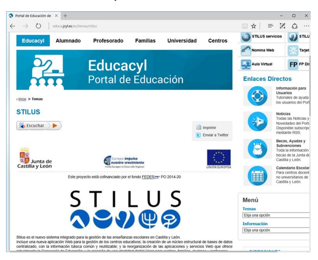
STILUS section of Portal Educacyl