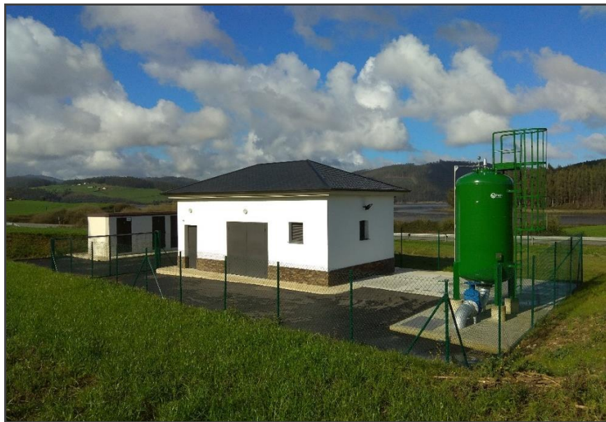
Vilavedelle's pumping facilities outside view

The sector is composed of two only facilities, called pre-treatment Vegadeo's Station and pumping Vilavedelle's Station, being this last one in charge of pushing up to the treatment plant the effluents sent from the pre-treatment Vegadeo's station plus the ones collected in the rural cores of Vilavedelle, Granda and Villagomil.