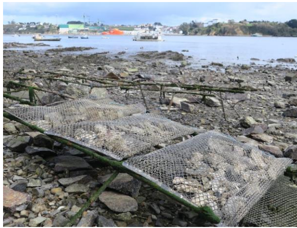
Oyster Farming of Eo's estuary