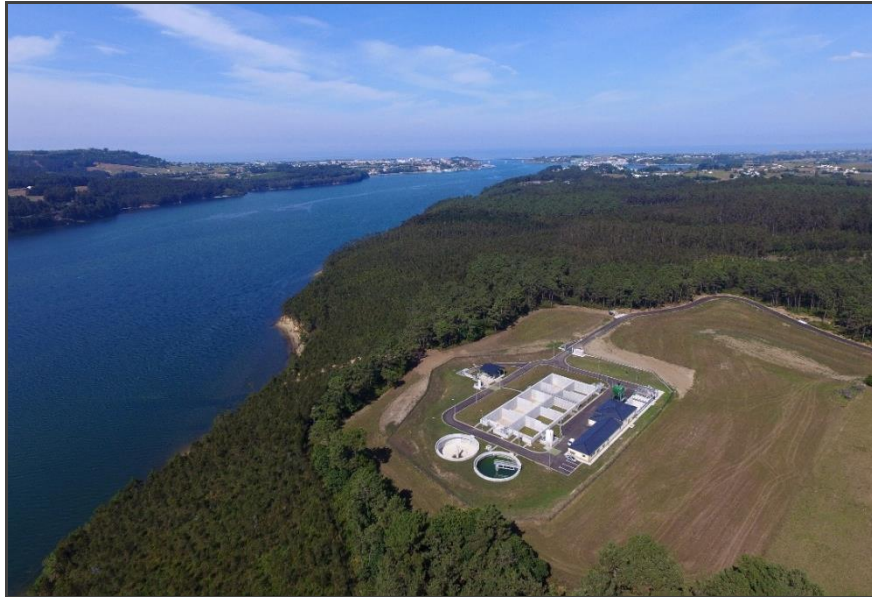
Sanitation Facilities' Aerial view

In general, the treatment lines that compose the waste water sanitation station of Eo's estuary are the following: