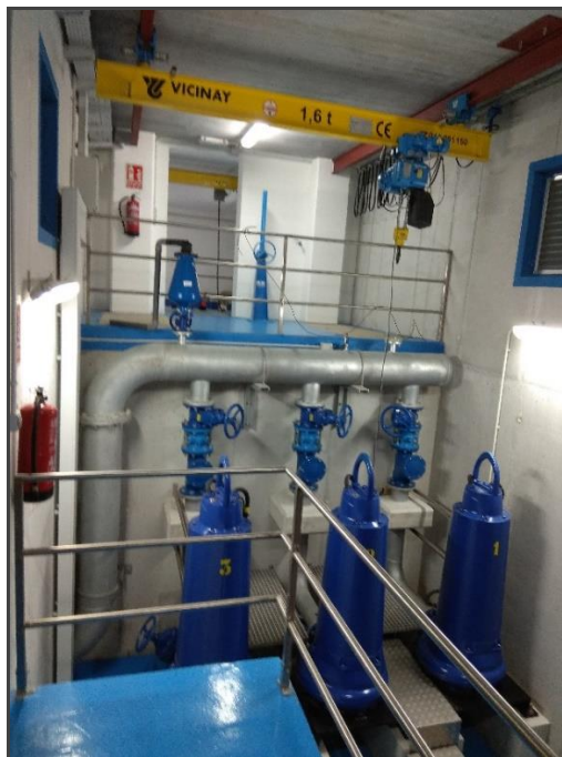
Main Pumping Units' View

This last line presents a pumping scheme 2+1, with capacity for lifting up from 84.00 l/s to 61.00 m.w.c (meter water column) with one only pumping unit and 119.00 l/s to 67.65 m.w.c with two pumping units. The electric power installed in this station goes up to 310.00 Kw.