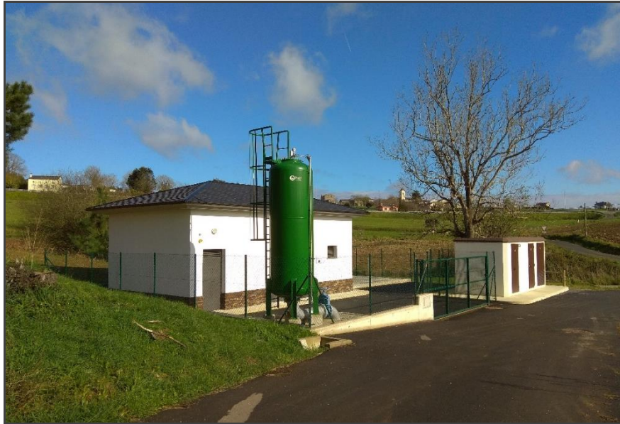
Aldeanova's pumping facilities outside view

The sector is composed of two only facilities, called pre-treatment Vegadeo's Station and pumping Vilavedelle's Station, being this last one in charge of pushing up to the treatment plant the effluents sent from the pre-treatment Vegadeo's station plus the ones collected in the rural cores of Vilavedelle, Granda and Villagomil.