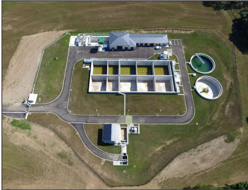
Aerial View of the two treatment lines