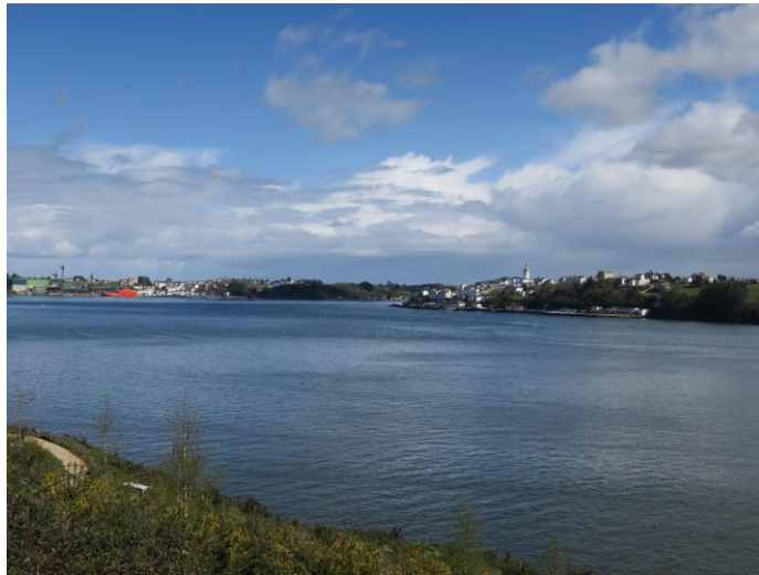
Eo River Estuary Views

Presented as good practice the Comprehensive Sanitation Plan of Eo's estuary . This estuary is located in the borderline between Galicia and Asturias and it is born in Eo's river mouth. Counts with about 10 km length and 14 square meters geographical extension. The proceeding consists in the comprehensive sanitation of the Asturian bank of Eo's estuary, which conforms the west border of the Asturian coastal strip.