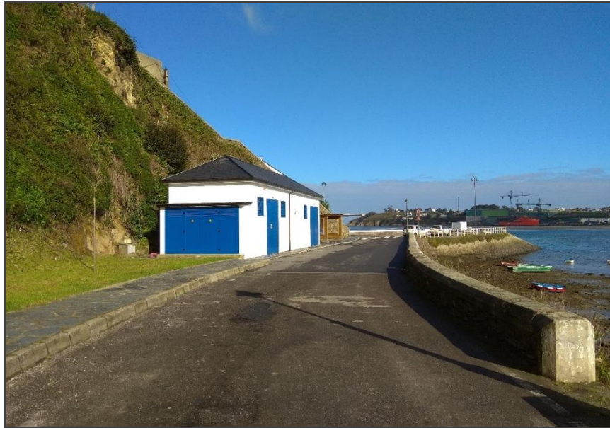
Castropol Pumping Facilities Outside View

This last line presents a pumping scheme 2+1, with capacity for lifting up from 84.00 l/s to 61.00 m.w.c (meter water column) with one only pumping unit and 119.00 l/s to 67.65 m.w.c with two pumping units. The electric power installed in this station goes up to 310.00 Kw.