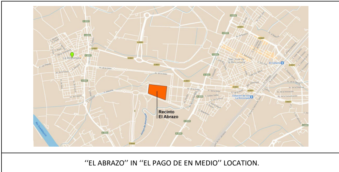
“EL ABRAZO” IN “EL PAGO DE EN MEDIO” LOCATION.

It will also have an impact on residents of nearby towns, such as Brenes or Alcalá del Río, making it attractive for them to travel to La Rinconada to spend their leisure time at the activities and functions offered by this new space, which is accessible to all, thus benefiting from the wide range of cultural activities in our municipality.