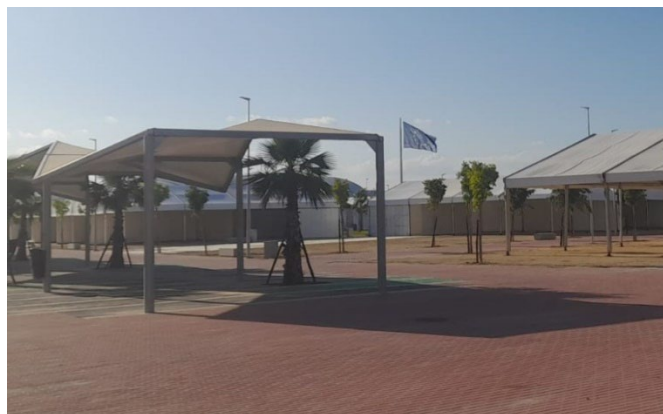
EL ABRAZO ENCLOSURE, EU FLAG.

The areas with the highest level of completion are the large central square and the boulevard that runs east-west through the site. Around these two arteries are located the spaces that house the largest areas of green space and free esplanades that host the events held in the area.