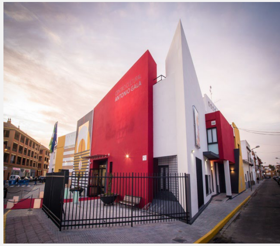
BEFORE THE PERFORMANCE