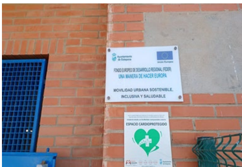
Permanent plates placed in the facilities