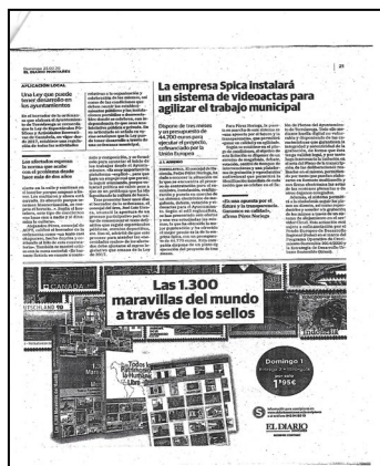
Press release of FEBRUARY 17, 2020 (awarding)