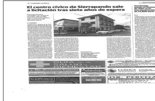
Press release of JULY 21, 2020 El Diario Montañés (end tender)