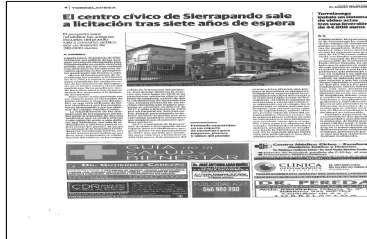
Press release of JULY 21, 2020 El Diario Montañés (end tender)