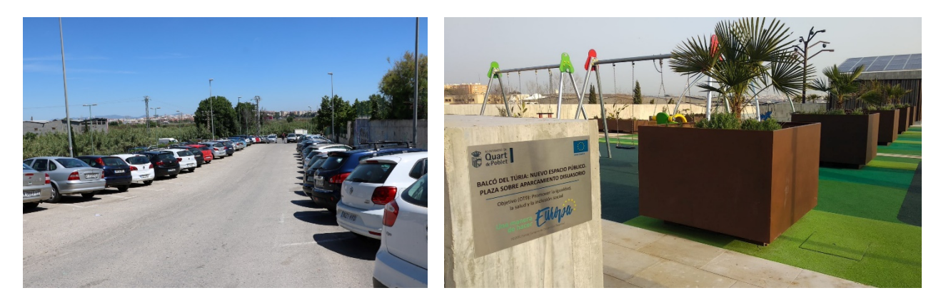
BEFORE AND AFTER PHOTOS OF THE AREA

It has also succeeded in revitalising the area and contributing to the renewal of the Río Turia neighbourhood, providing it with a large open-air space with vegetation, benches, games and facilities for public use. It has also provided a direct connection to the Turia Natural Park, which bestows its name on the project.