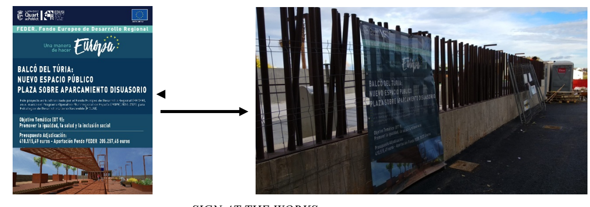
SIGN AT THE WORKS

In regards to regulatory communications, throughout the works phase an informatory notice of works was erected on site and once works were completed a permanent plaque was installed, as well as a specific section on the member state's unique municipal web portal, notifying visitors of the ERDF's co-financing.