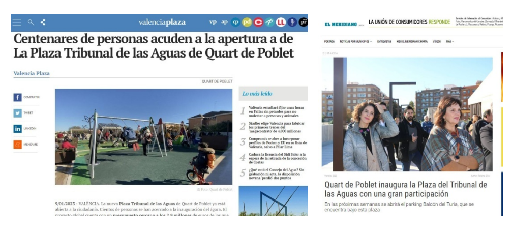
NEWS IN VALENCIA PLAZA AND EL MERIDIANO

In terms of social networks, dissemination was undertaken on the City Council's Facebook profiles, both the municipal one and Urbanism and Environment (department in charge of the Sustainable and Integrated Urban Development Strategy, EDUSI). The municipal Instagram and Twitter profiles were also used.