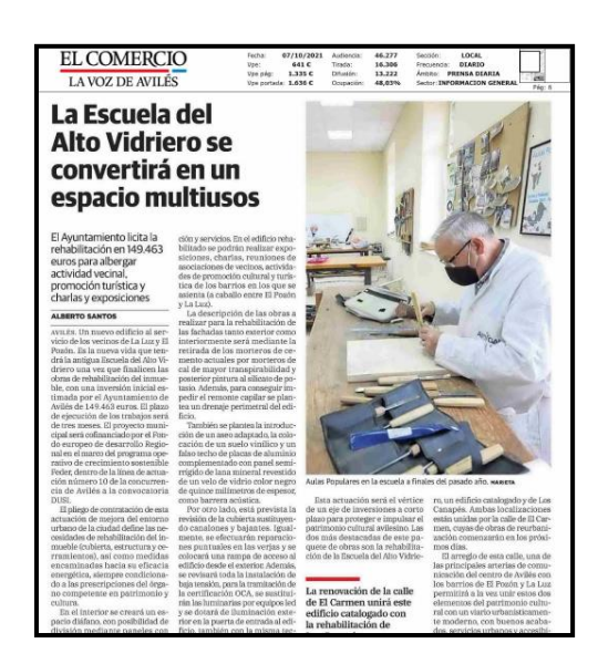
La Voz de Avilés October, 7th, 2021

• Avilés social media profiles: Facebook, Twitter, Instagram