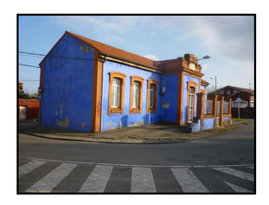
The building before de rehabilitation

Inside, two open spaces have been created, both with the possibility of use for exhibitions and activities. In addition, an adapted toilet has been set up, the carpentry, lighting, sanitation, plumbing, drainage, urbanization and outdoor gardening have been renovated.