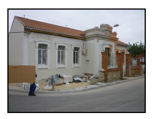
During construction works