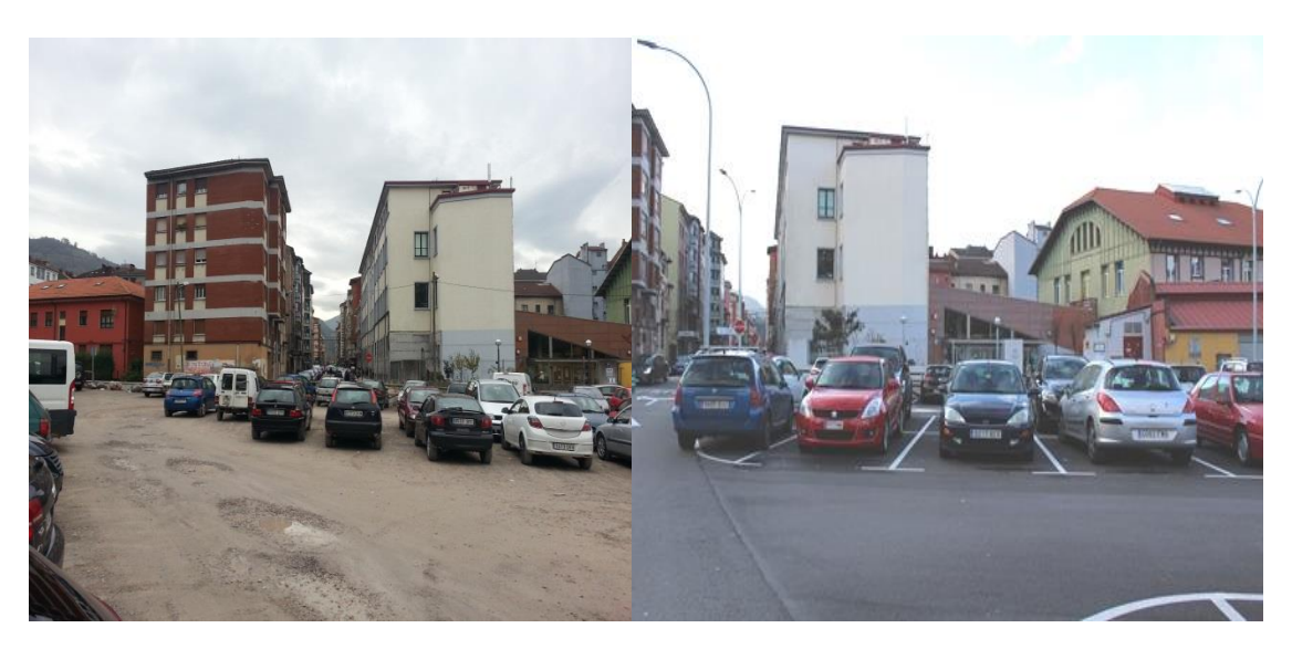
Before and after pictures of the work.