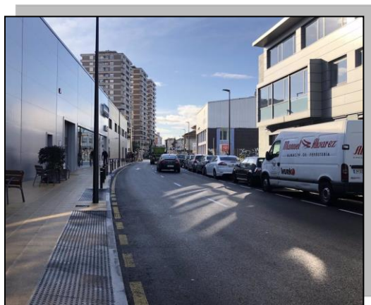
Renovation of the road and construction of Sidewalks in the PASEO DEL NIÑO - Current state