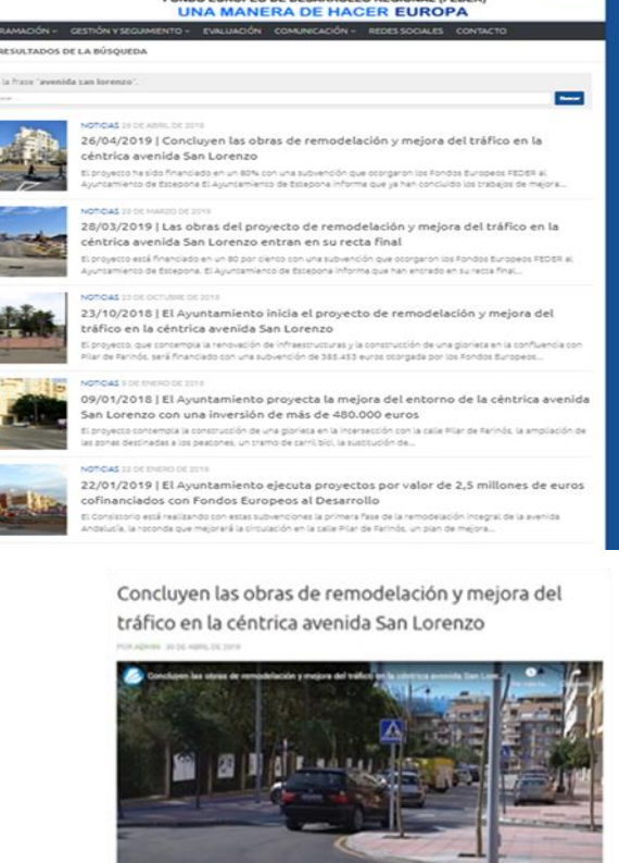
Conclusion of the works