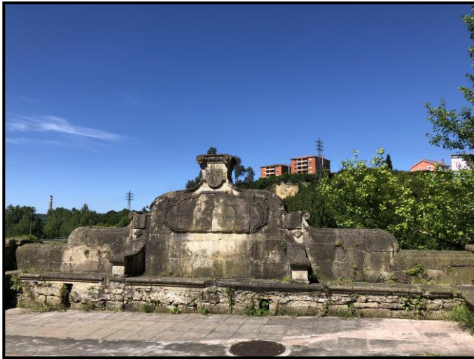
State of the monument before the restoration