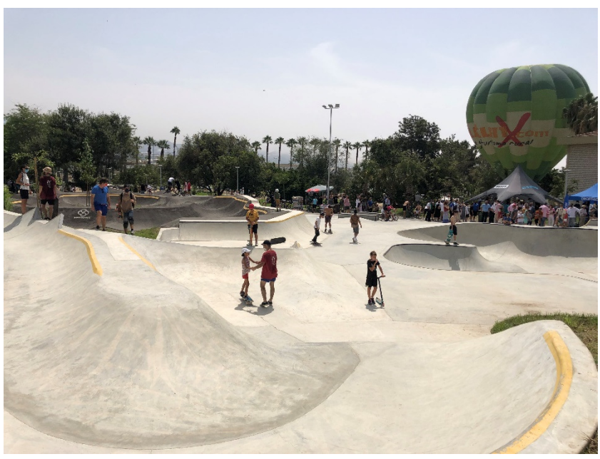
1Skate Park tracks

The total eligible cost of the action was €255,060.23, of which €204,048.18 are from FEDER aid. The operation has a direct impact on 58,546 inhabitants, that is, on the entire population of Motril, as it is an open space, free to access and located in the center of the town.