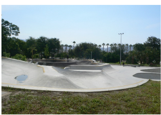
5 Skate Park Tracks

Therefore, with this action, the problem of the lack of spaces dedicated to youth leisure is intended to be resolved, as well as the enhancement of a disused municipal space.