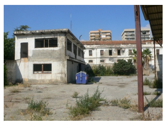
4 Degraded ancient space before the performance.

In addition, with this action, the image of the city towards the outside has been improved, since it houses the Office of Information and Tourism of Motril, a place where visitors and tourists come to know the city.