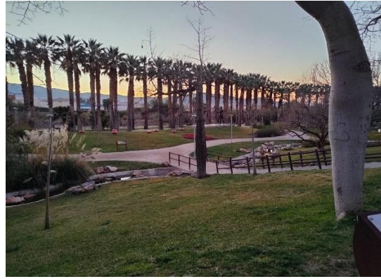
Footpaths before the Action

3°. The replacement of street furniture, fountains and signposting of the areas of interest in the park, proposing attractive routes between the different areas.