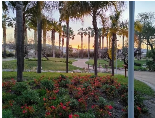
. Trees after the action