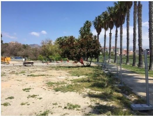
11. Trees before the action 12

5°. Improvement of the landscaping and trees in the park, reforming several sectors of the park's interior irrigation system.