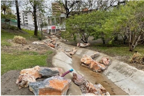
9. Footpaths after the Performance 10