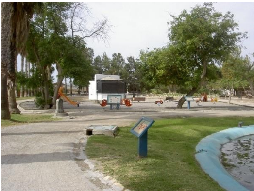
1. Playground after the performance

1º. The improvement and extension of the children's play area by improving the terrain and including new elements and the installation of a continuous pavement throughout the area.