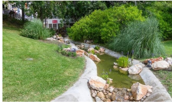
. Footpaths before action

5°. Improvement of the landscaping and trees in the park, reforming several sectors of the park's interior irrigation system.