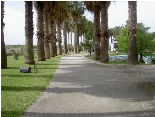
5. Furniture after the performance6

3°. The replacement of street furniture, fountains and signposting of the areas of interest in the park, proposing attractive routes between the different areas.