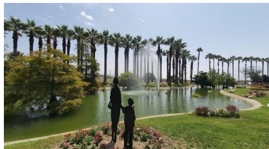
. Pond after the performance