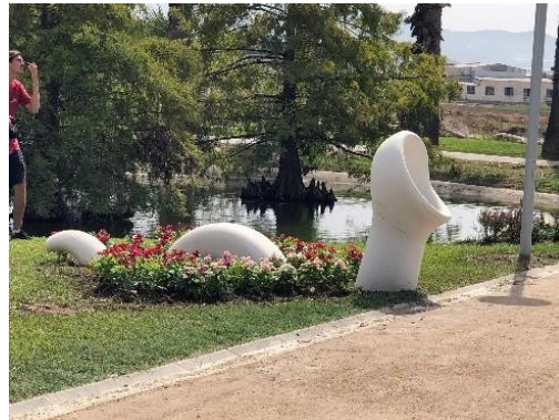
. Furniture before the performance

4°. The naturalization of the pond , which is located inside the park and is fed by a stream that runs from the upper area of the park and which, when it reaches the pond, uses a pumping system to recirculate the water back upwards, which had water leaks. This action has managed to avoid water leaks, integrate the pond into the park's surroundings and improve the water recirculation system. Ornamental elements, rocks, waterfalls, etc. have been introduced to integrate the wetlands with the rest of the elements.