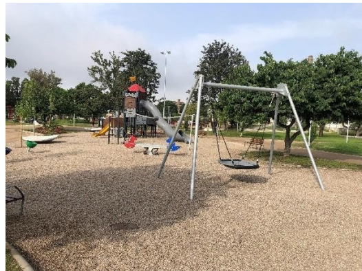
2. Children's play area before the action.

2º. The improvement and extension of gardens, paths, furniture and signposting , consists of the adaptation of the existing paths in the park, which were formed by a pavement of loose materials, which due to the action of time and water, were very deteriorated and dangerous. The landscaped area and paths have also been extended, incorporating the old courtyard of the Cardinal Belluga School, located next to the “The American Nations Park”, integrating this area as a green zone of the park.