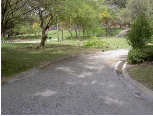
3. Footpaths after the Action 4.