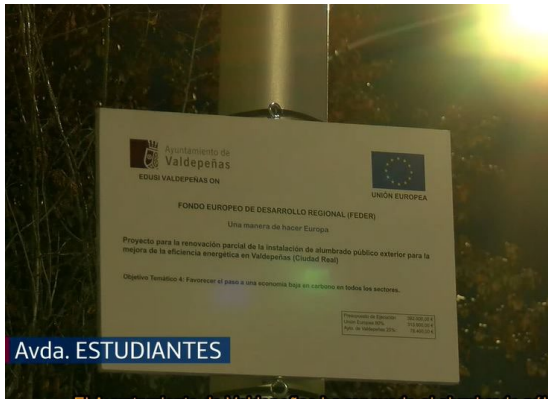
Photo of the displayed notice

The operation was also publicised, obviously, on the website: http://edusi.valdepenas.es/ and accessed by clicking on “programación” [programmes]/ “objetivo temático 4” [thematic objective 4] and on “comunicación” [communication]/ “línea de actuación 4” [line of action 4].