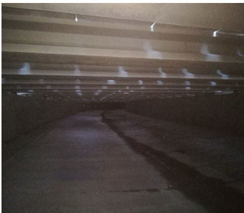
After: Covered channel of “La Veguilla”