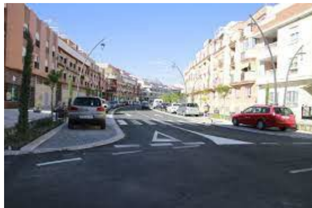
After: Visual appearance of the area above the covered channel of “La Veguilla”.