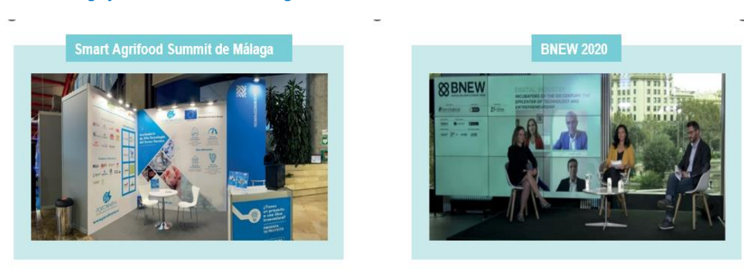
The Smart Agrifood Summit in Malaga

Participation in benchmark events in the sector such as the Smart Agrifood Summit in Malaga in 2019, 2020, and 2022, FIGAN Zaragoza International Livestock Fair in 2021, or in more general events, with their participation in BNEW, held for the first time in 2020 in Barcelona, also being a good example of diffusion of the project.