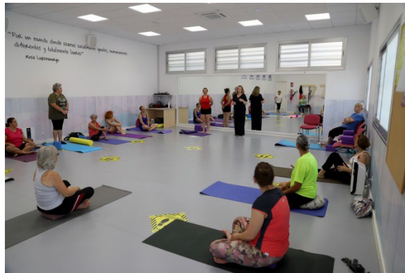
PILATES ACTIVITY IN THE SUMMER SCHOOL “GROWING TOGETHER”, C.C. “LOS SILOS”.

The "Los Silos" Civic Centre is hosting many activities within the framework of the "Programa Mujer-Es", a programme of activities of the Department of Equality, promoting a plural, creative, vindicative and transformative feminism. One of the most outstanding activities is currently being carried out in the Summer School "Growing Together", offering yoga and pilates workshops to the users, which work on the autonomy and health of local women.