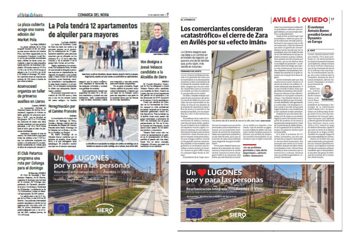
Local newspaper El Fielato, 3/15/2023