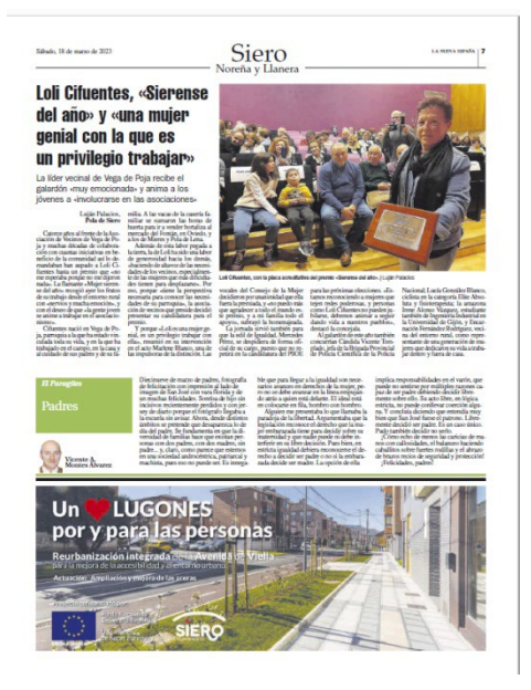
Regional newspaper La Nueva España, 3/11/2023