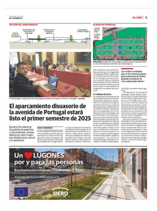
Regional Newspaper El Comercio, 3/17/2023

Spot (9) of 20" was broadcast on Television of the Principality of Asturias (TPA) at a rate of 3 daily in midday, after-dinner and afternoon slots, on March 22, 23 and 24, 2023 https://www.youtube.com/watch?v=UnvZpdgvHMw