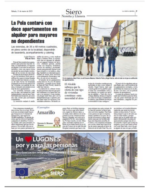
Regional newspaper La Nueva España, 3/18/2023