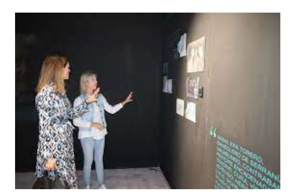
Paco Rabal Interpretation Centre

This action has entailed a total cost of €238,606.42, which has been co-financed up to 80 % by the European Regional Development Fund (ERDF), which has contributed a total of €190,885.14.