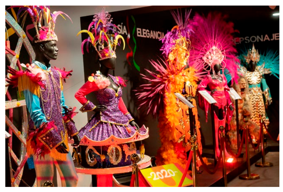
2020 Carnival costumes

On the other hand, thanks to this action, both citizens and tourists have the opportunity to learn, remember and value part of the cultural heritage of Águilas, in suitable spaces adapted for all types of public.