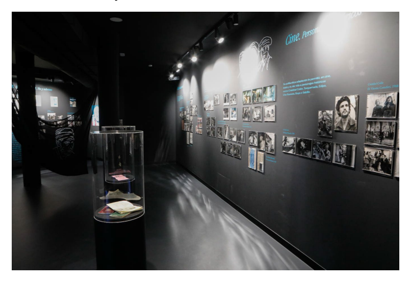
View of part of the exhibition in the Francisco Rabal Interpretation Centre.

As for social responsibility, with this type of action the local cultural heritage is valued and new spaces are proposed for Águilas residents and visitors to meet, which undoubtedly helps to achieve greater social cohesion. Strengthening the pride of the population is a cohesive and uplifting factor for the community.