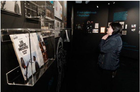
Inauguration of the Carnival Museum and the Francisco Rabal Interpretation Centre.

In short, an intense work of action dissemination has been carried out, highlighting that it has been co-financed by the European Regional Development Fund at 80 %, within the framework of the Spanish Multirregional Operational Program (POPE) 2014-2020.