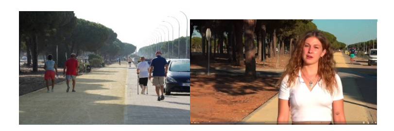
Fondo Europeo de Desarrollo Regional (FEDER) "UNA MANERA DE HACER EUROPA"