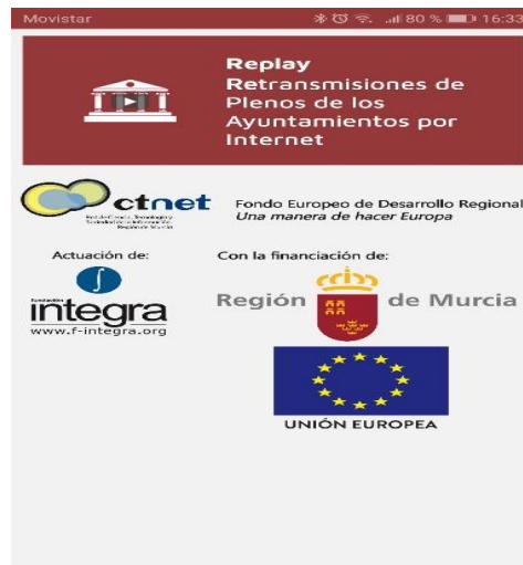
App screen for the Smart TV app