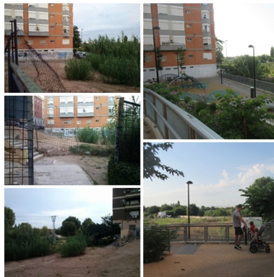
THE DETERIORATED AREA HAS BEEN TURNED INTO A PLEASANT SUSTAINABLE SPACE

The intervention has attained the objective of disseminating and enhancing the value of the area's natural and cultural heritage and promoting its potential for tourist use. It has also succeeded in transforming a deteriorated, unused space into a pleasant, accessible area for residents.