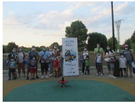
MEETING WITH THE PUBLIC TO RAISE AWARENESS OF THE IMPORTANCE OF EUROPEAN CO-FINANCING FOR THIS PROJECT'S IMPLEMENTATION