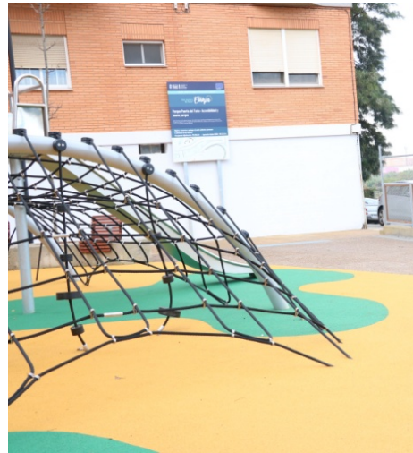
INFORMATION SIGN AT THE WORKS