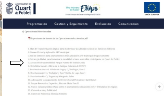
SINGLE WEB PORTAL

This intervention was included in information leaflets on interventions in the Rio Turia neighbourhood.