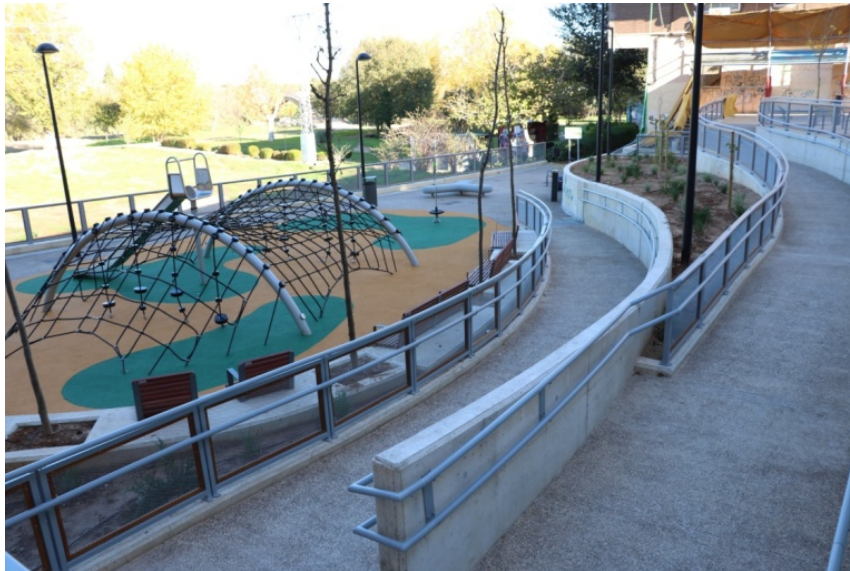
IMAGE OF THE COMPLETED INTERVENTION. IN THE BACKGROUND, RIVER TURIA FLUVIAL PARK

The financed intervention has made it possible to turn an unused, deteriorated site into a park that citizens of all ages can use and enjoy, thus recovering its strategic value. Children's playground equipment, benches on which to rest, vegetation and trees have been installed to provide shade. A new entrance to the natural space of the River Turia has also been opened, including a wide ramp so that pedestrians and cyclists can access the riverbed to follow its course. Lastly, streetlights were installed using LED lamps so as to save energy.