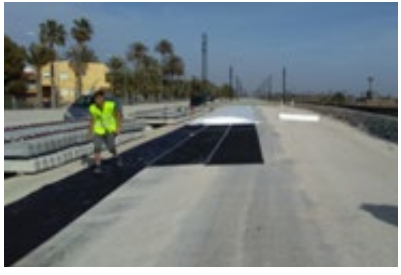
Elastomeric blanket installation at San Isidro station

An elastomeric blanket consists of a layer of easily placed insulating material. It achieves elasticity in the structure to reduce vibrations.