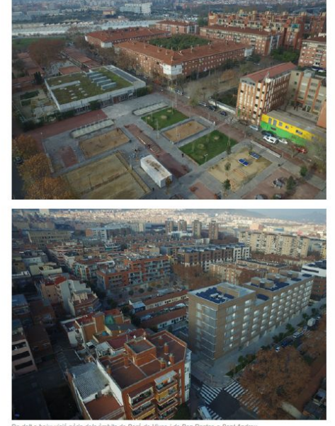
De dalt à baix: vi

LA MOBILITAT SOSTENIBLE EN LA ZONA DEL POLÍGON DEL BON PASTOR, NOVA OPERACIÓ APROVADA A L'EDUSI EIX BESÒS