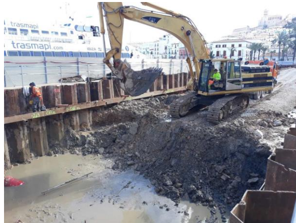
Figure 1. Sheet piling walls

This solution offers greater advantages, among others the saving of 50% of the planned budget.