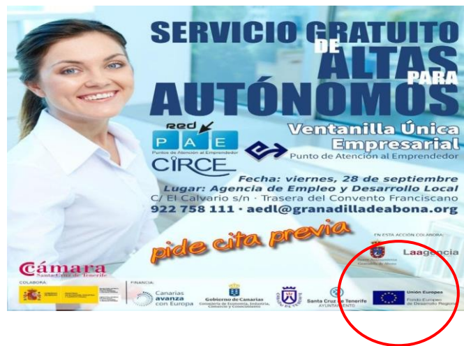
Publicity on interurban buses in Tenerife (TITSA).